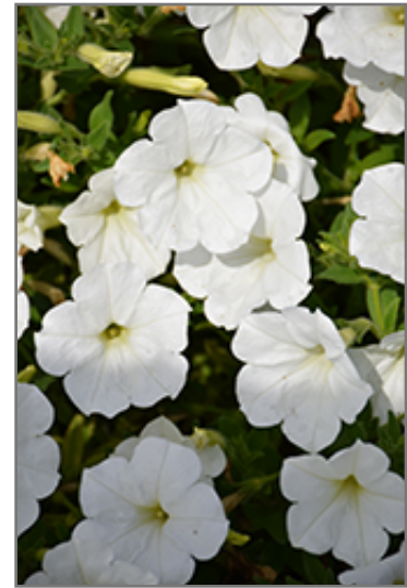
ColorRush White Petunia flowers