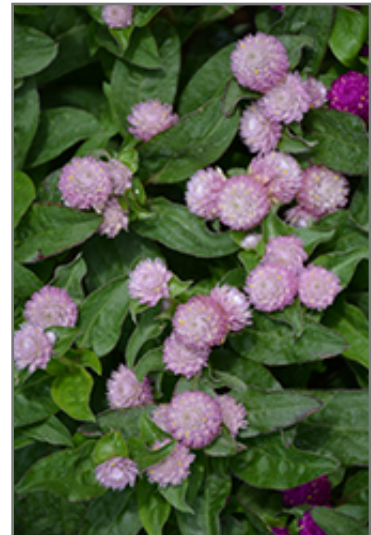
Ping Pong Lavender Globe Amaranth flowers