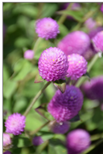
Ping Pong Lavender Globe Amaranth flowers

Ping Pong Lavender Globe Amaranth is recommended for the following landscape applications;