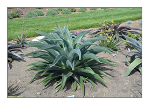
Iron Man Mangave