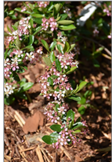
Ground Hug Aronia flowers