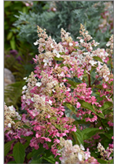
Pinky Winky Hydrangea (tree form) flowers

Pinky Winky Hydrangea (tree form) will grow to be about 8 feet tall at maturity, with a spread of 8 feet. It tends to be a little leggy, with a typical clearance of 4 feet from the ground, and is suitable for planting under power lines. It grows at a medium rate, and under ideal conditions can be expected to live for 40 years or more.