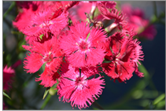
Rockin' Rose Pinks flowers

Rockin' Rose Pinks is recommended for the following landscape applications;