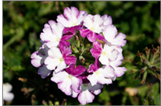
Firehouse Purple Fizz Verbena flowers

Firehouse Purple Fizz Verbena is recommended for the following landscape applications;