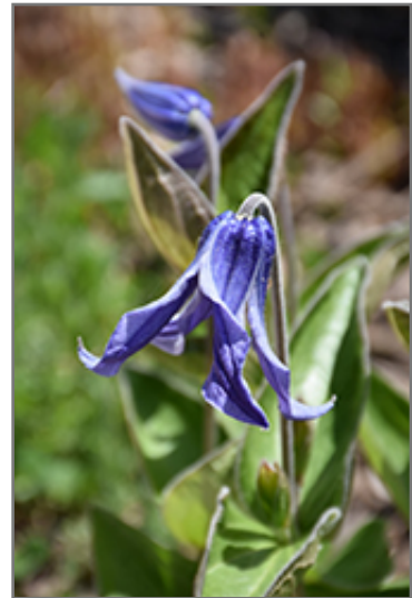
Blue Ribbons Bush Clematis flowers