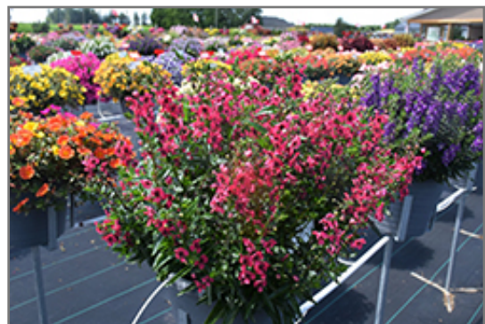
Archangel Cherry Red Angelonia in bloom