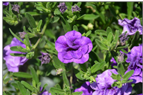
MiniFamous Double Blue Calibrachoa flowers