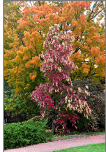
Sourwood in fall

This tree does best in full sun to partial shade. It does best in average to evenly moist conditions, but will not tolerate standing water. It is very fussy about its soil conditions and must have rich, acidic soils to ensure success, and is subject to chlorosis (yellowing) of the foliage in alkaline soils. It is quite intolerant of urban pollution, therefore inner city or urban streetside plantings are best avoided, and will benefit from being planted in a relatively sheltered location. Consider applying a thick mulch around the root zone in winter to protect it in exposed locations or colder microclimates. This species is native to parts of North America, and parts of it are known to be toxic to humans and animals, so care should be exercised in planting it around children and pets.