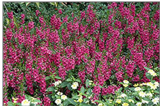
Archangel Dark Rose Angelonia in bloom