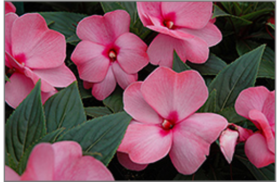
Celebrette Appleblossom New Guinea Impatiens flowers

Celebrette Appleblossom New Guinea Impatiens is recommended for the following landscape applications;