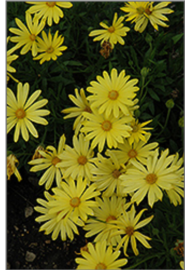
Voltage Yellow African Daisy flowers