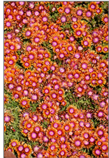
Fire Spinner Ice Plant flowers