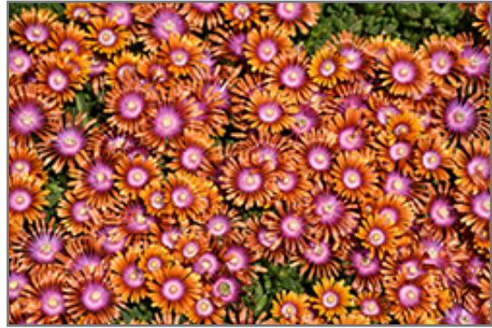
Fire Spinner Ice Plant in bloom

Fire Spinner Ice Plant is recommended for the following landscape applications;