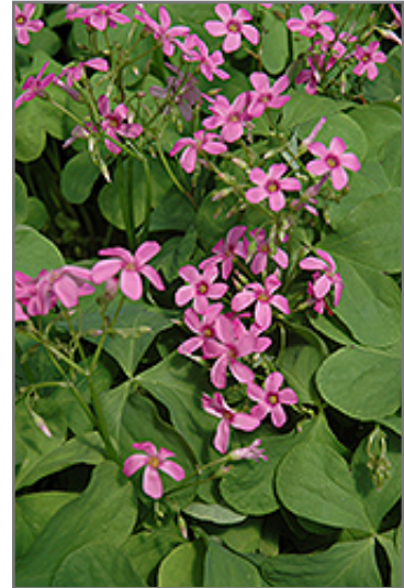
Pink Wood Sorrel flowers