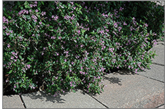
Leptodermis in bloom

This shrub does best in full sun to partial shade. It prefers to grow in average to moist conditions, and shouldn't be allowed to dry out. It is not particular as to soil type or pH. It is somewhat tolerant of urban pollution. This species is not originally from North America.