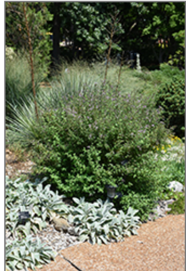
Leptodermis in bloom